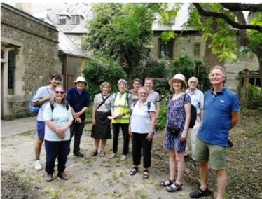
In the garden of Little St Mary's Church on the Cambridge walk