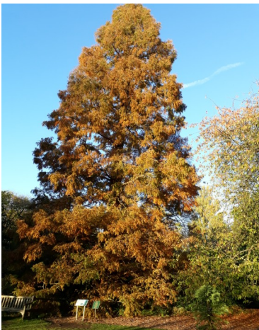
Dawn Redwood in Autumn