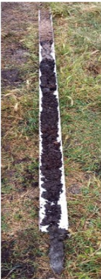
An example of the Fen deposits brought to the surface by an auger coring

The second, in July, was to the Great Fen, between Ramsey Heights and Yaxley, to visit the area around Holme Fen and Whittlesea Mere which was designated an LGS in 2020. As our county has the largest area of surface peat in the Fens, CGS has recognised the important heritage value of our local Holocene geology i.e. the deposits formed since the end of the last glaciation (about 12,000 years ago). These consist not only of the surface peat (now mostly degraded and comprising the famous 'peat soil'), but also a complex sequence of buried deposits including significant amounts of older peat, some more than 7,000 years old. A band of marine silt and clay, from tidal salt marshes and mudflats, about 4,000-3,500 years old (Late Neolithic and Early Bronze Age), can be found within the peat in many places. The Great Fen has a unique combination of fenland geological features and (again helped by Dr Steve Boreham) we were able to examine a c.3 metre deep 'core' (reaching to the Oxford Clay bedrock) from the Whittlesey Mere area to see some of these: lake marl, the marine clay and a deep section of well-preserved, buried 'Lower' peat made up of reed peat, wood peat, detritus mud and containing several recognisable seeds. An enjoyable day, also with plenty of wildlife and history, such as the Holme Post and the Rothschild Bungalow.