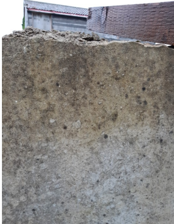
Totternhoe Stone, from Bedford